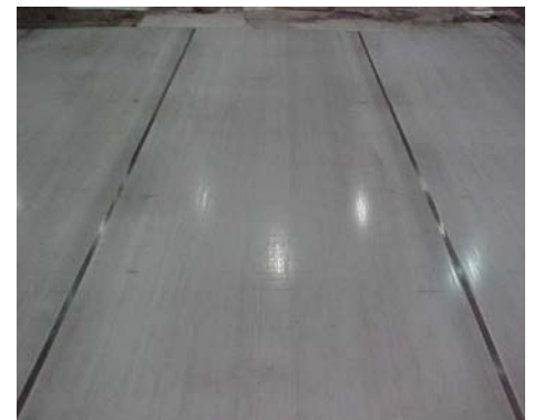
Typical Brighton Welded Plate

CONTACT BRIGHTON FOR ALL YOUR WELDED PLATE NEEDS